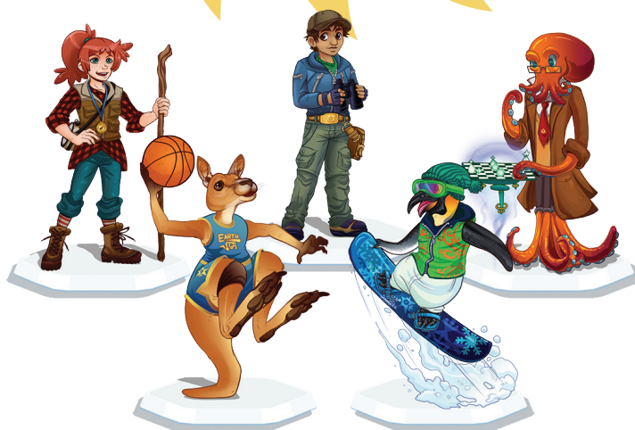
Over 8,000 custom characters for kids to create!